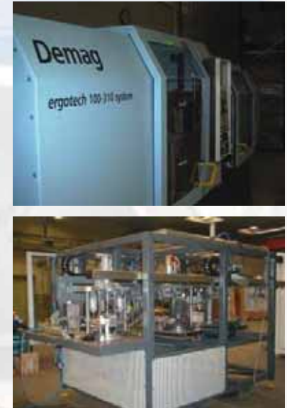
Three-piece casing injection molding with mechanical joint