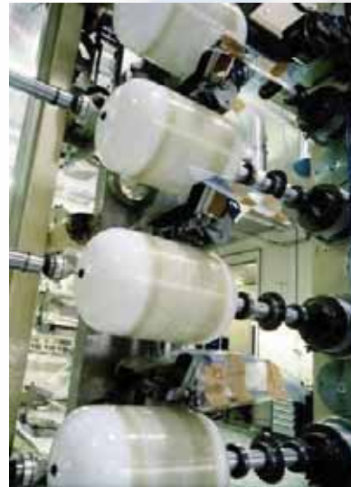
Fiberglass layer filament winding and oven-curing