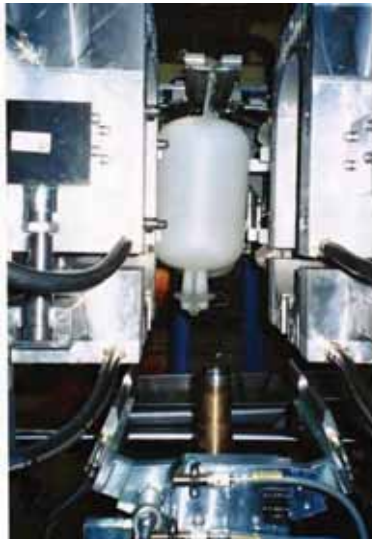
HDPE liner blow molded