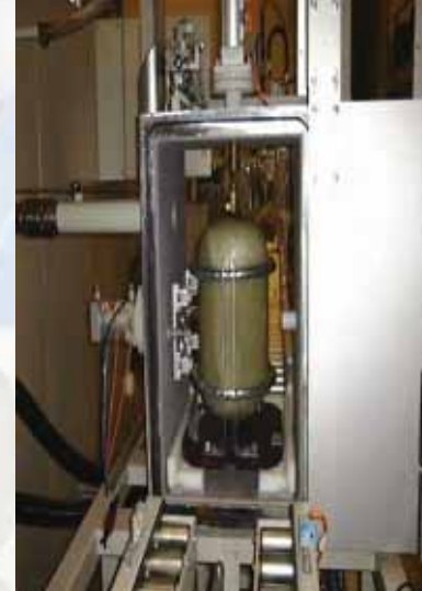
Test Process: pneumatic pressure and tightness